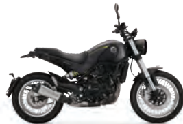
DARK MATT GREY