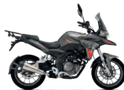
MATT GREY MET