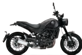
DARK MATT GREY